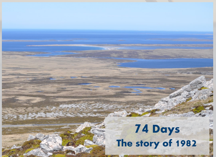
74 Days The story of 1982