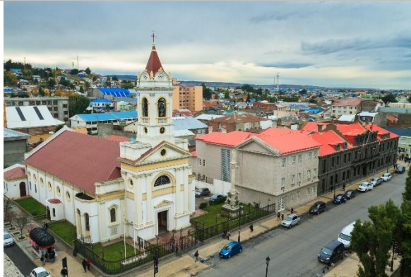
Punta Arenas city (main square) from high