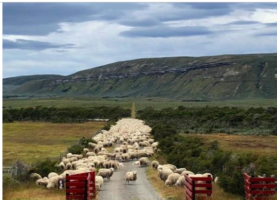
Estancia Santa Olga