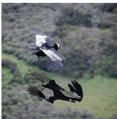
Cóndor, national emblem