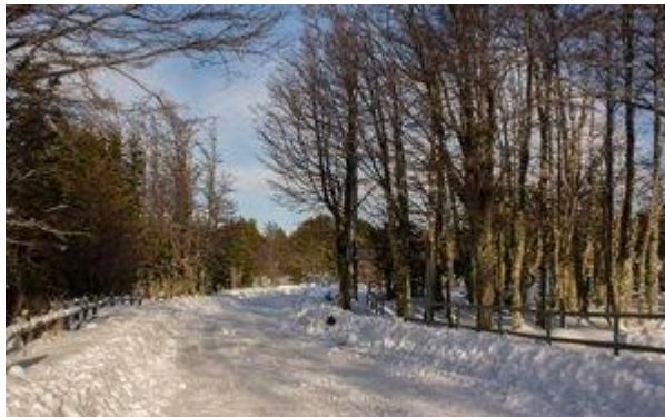
Magalleen Reserve National park *