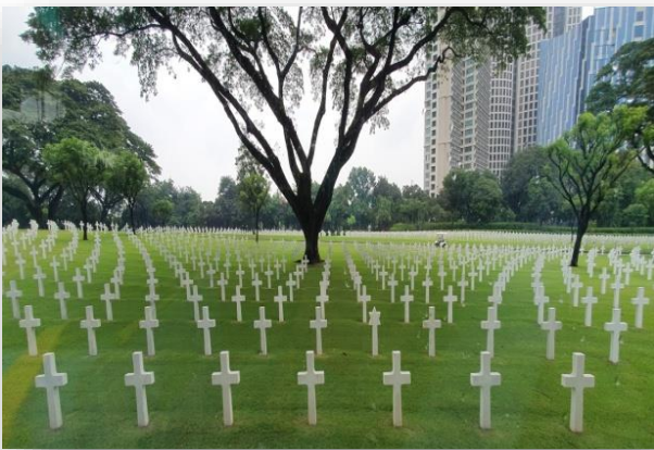
American War Memorial and Cemetery