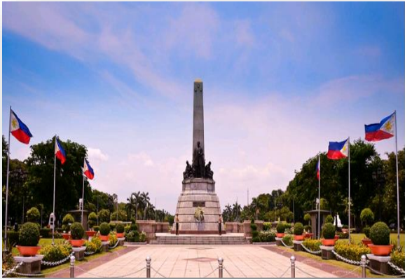
Rizal Park Monument